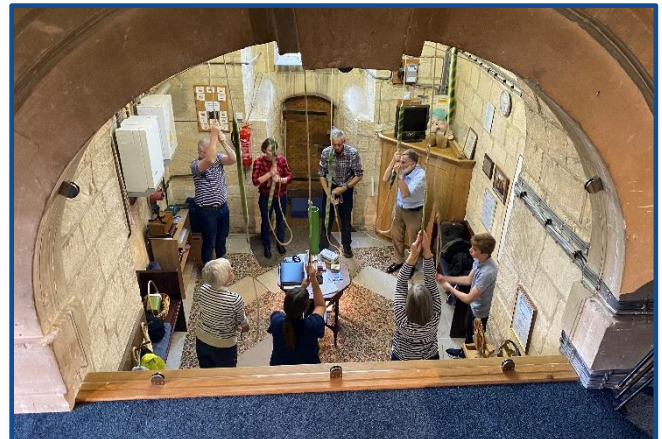
St Mary's Church Longcot

Church bells have rung out for centuries, calling people to worship, in celebration of special occasions, in remembrance and to mark special events.