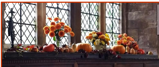
Harvest window in St Andrew's Shrivvenham

The sessions will rotate between the churches in Ashbury, Shrivvenham, Watchfield and Longcot on a weekly basis.