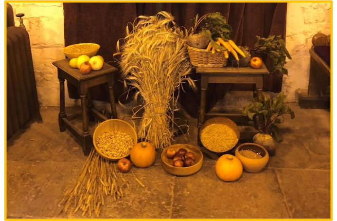
Harvest display in St Mary's Ashbury