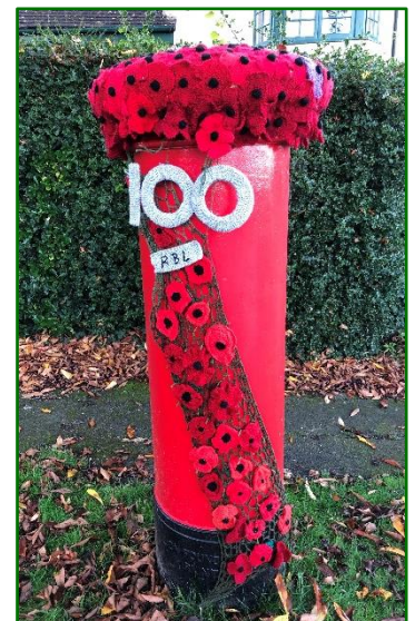
Post Box at Ashbury Crossroads