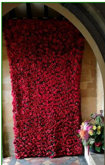
Porch at St Thomas, Watchfield

November pierces with its bleak remembrance Of all the bitterness and waste of war. Our silence tries but fails to make a semblance Of that lost peace they thought worth fighting for. Our silence seethes instead with wraiths and whispers, And all the restless rumour of new wars, The shells are falling all around our vespers, No moment is unscarred, there is no pause, In every instant bloodied innocence Falls to the weary earth, and whilst we stand Quiescence ends again in acquiescence, And Abel's blood still cries in every land One silence only might redeem that blood Only the silence of a dying God.